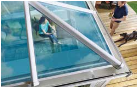
Conservatory roof glass upgrade