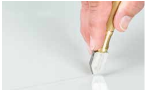
Single glass & mirror cut to size