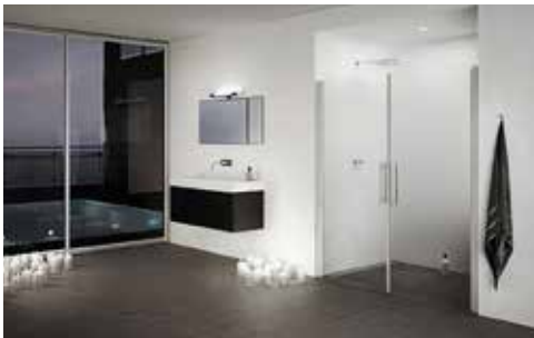
Glass doors & shower doors