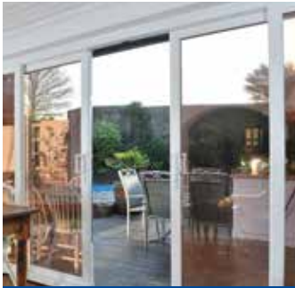
Sliding Patio Doors