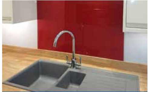
Glass kitchen splash-backs