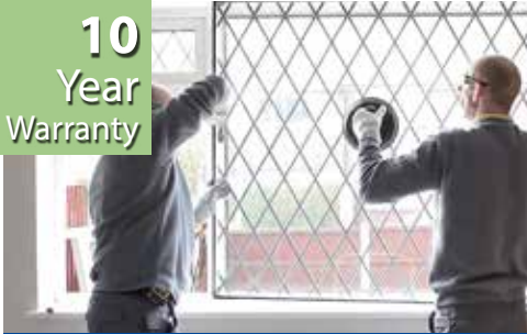
Sealed unit & glass replacement